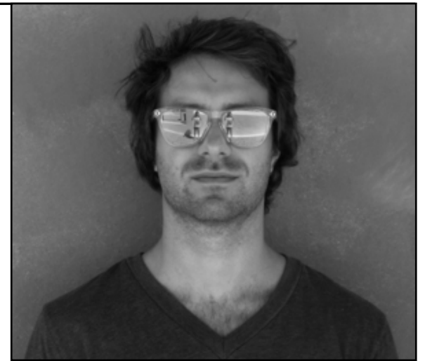
Simple Plan's Sébastien Lefebvre's new solo project hits record store shelves October 20th

Even with a musical side project, Lefebvre keeps busy with an online podcast called Man of the Hour which he's co-anchored since 2006. Also an avid Tweeter, he expressed his affection for Lego's which begged a question in the interview. He shared that on a way to a meeting "we passed a store with Lego in the window and I've been playing Lego