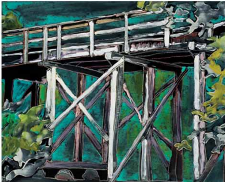
The Galloping Goose, urethane on board, 2009, 24"x30"