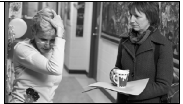
How Are You?

The Necktie is the kind of animated short that's helped boost the reputation of the NFB worldwide. The film begins with a young man who's about to start a new job and quickly goes through to the day many years later where he realizes that he's better suited to something else. Sure, it has an anti-corporate bend that's easy fodder for artists, but this is the work of an artist, and it's great.