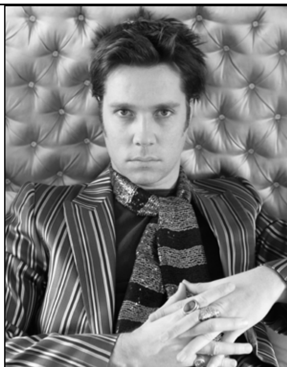
Above: Rufus Wainwright

Rufus is currently touring with his band, cross-promoting his new CD/DVD release Milwaukee at Last!