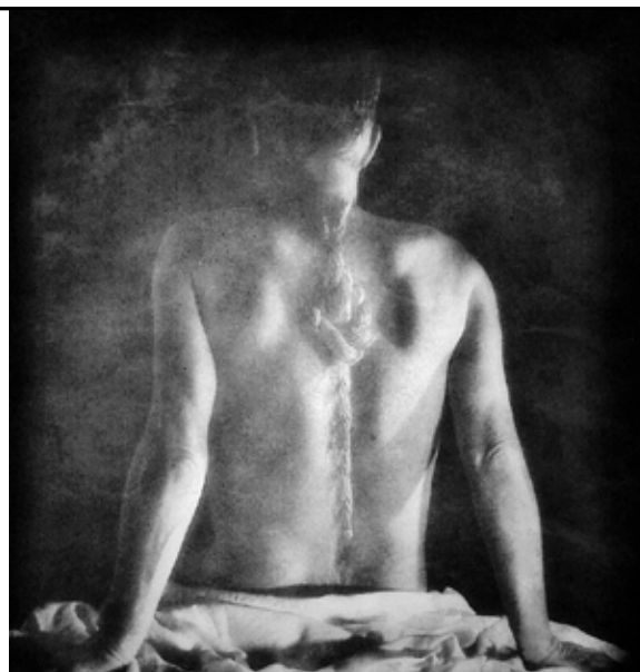
"4am" (above) is on display at The Leyton Gallery as part of their newest exhibit titled "Penetralia"

During the Second World War when women joined the work force, they were depicted in powerful positive roles in film, Pelley shared. When the men returned from the war and were confronted with this role reversal and more independent women, the femme fatal character became prominent in film.