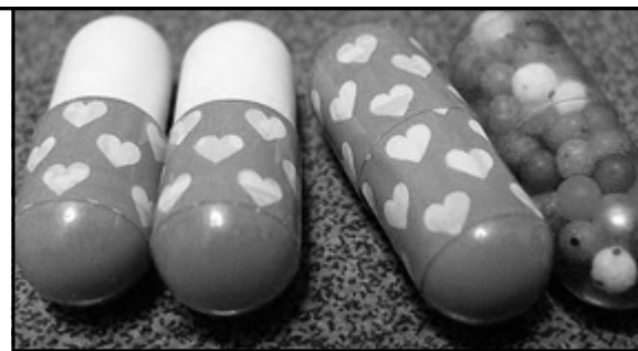
Can a pill be the answer to finding real love?